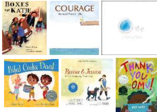
Monthly Feeling Words