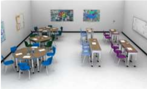
Grade 3 furniture for all rooms