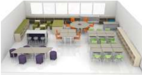
Grade 4 sample furniture