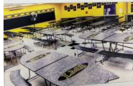
Samples of possible seating