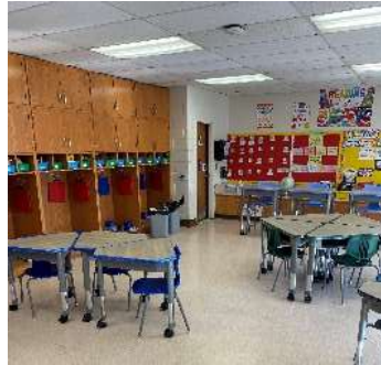
Grade 3 actual classroom