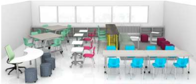
Furniture in room 127