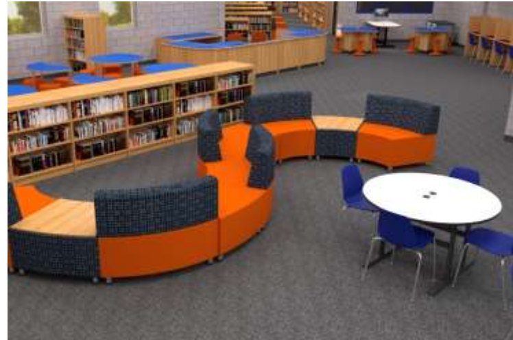
Samples of possible seating