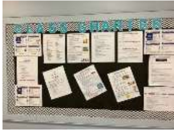
Social Emotional Learning