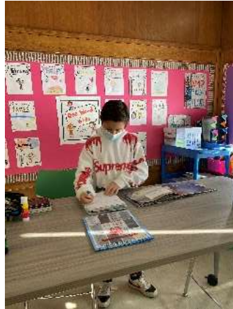
Grade 4 actual classroom